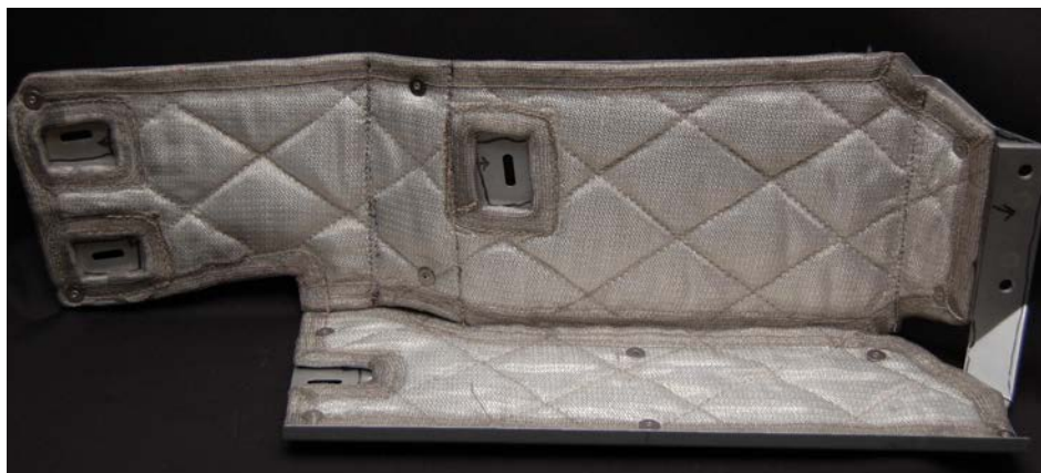
Humvee Exhaust Shield