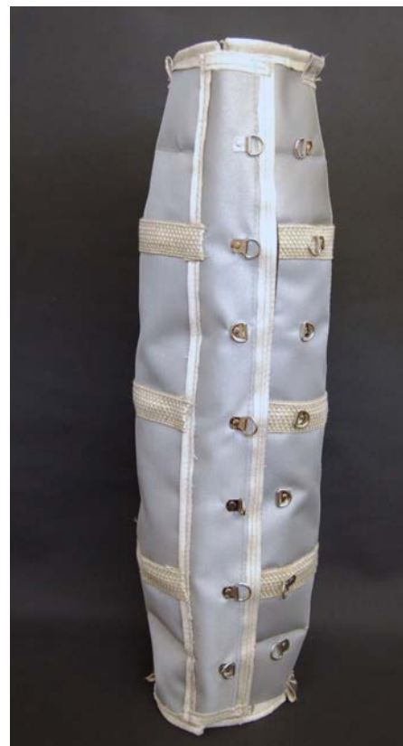
Bellow Tube Seal